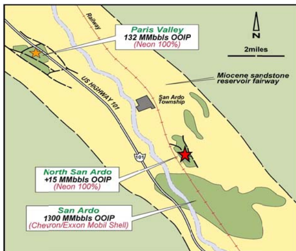
Location map North San Ardo, Salinas Basin, California

The well was drilled into the southern lobe of the Lombardi oil sand reservoir, where two of the most productive wells in the field are located. The well was successfully drilled horizontally to a measured depth of 4301 feet (1311 metres) into a thick section of the Lombardi reservoir, and encountered excellent oil shows throughout a 1320 foot (402 metre) horizontal pay interval. A slotted liner was placed over that section in order to produce oil from the interval.